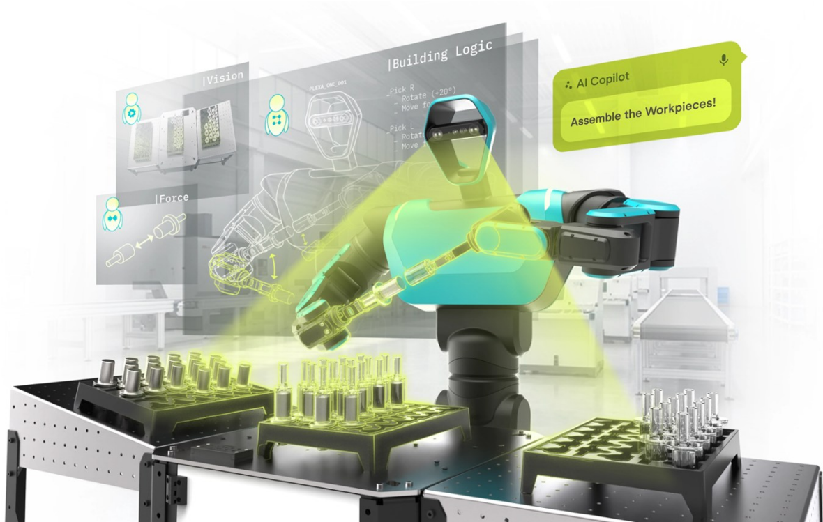
[Image 1]: The new PLEXA One based on the Industrial Humanoid Platform from fruitcore robotics.

Image material – Higher-quality images available upon request